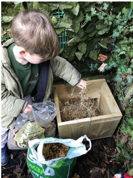
Setting up the hedgehog house