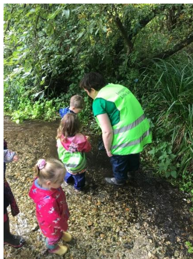
River dipping in Whitchurch