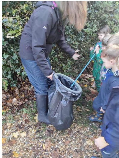
Lights off and litter picking before Forest School