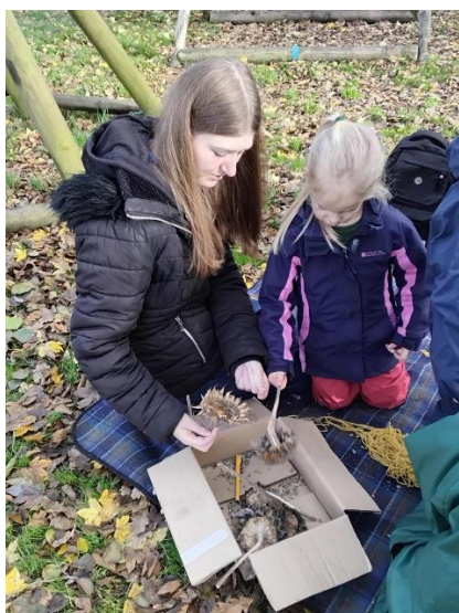
Using the sunflowers we grew in the summer to make bird feeders