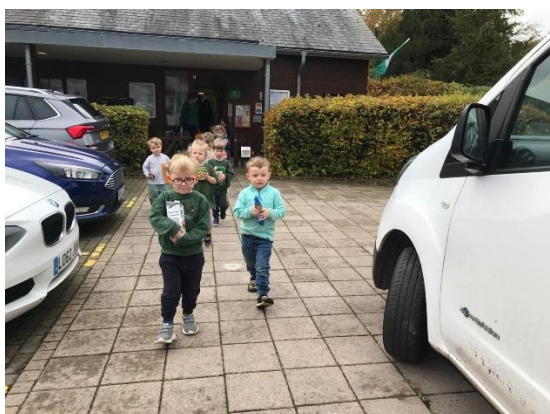
Taking food donations to the food bank collection van