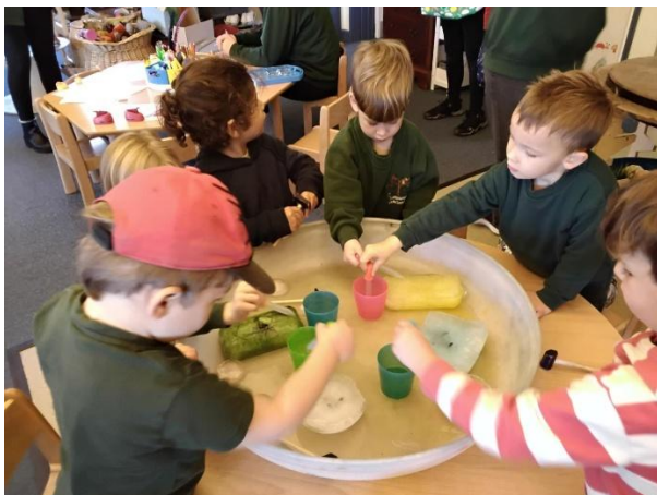
Melting ice – save the polar bears and penguins!