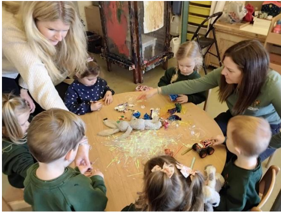
Making Christmas decorations from recycled materials with staff from Raymond Brown